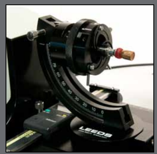
Bullet mounted to a pin mount with sticky wax

The Leeds Universal Holder eliminates the need for multiple sample holders and accessory brushes for firearms examinations. The Leeds Universal Holder has 90° vertical-to-horizontal positioning range. It also has a 360° rotatable chuck that can hold an item as small as .030″ wire, to as large as a 10-gauge shotgun shell. This unique holder allows a shell to be gripped by its inside, or outside diameter, and also can hold a shell by the extractor.