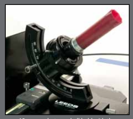
12-gauge shotgun shell held with the Leeds Magnetic Shell Mount