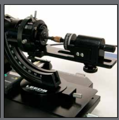
"On-centers" projectile holder