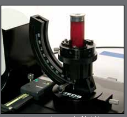
12-gauge shotgun shell held by the outside diameter