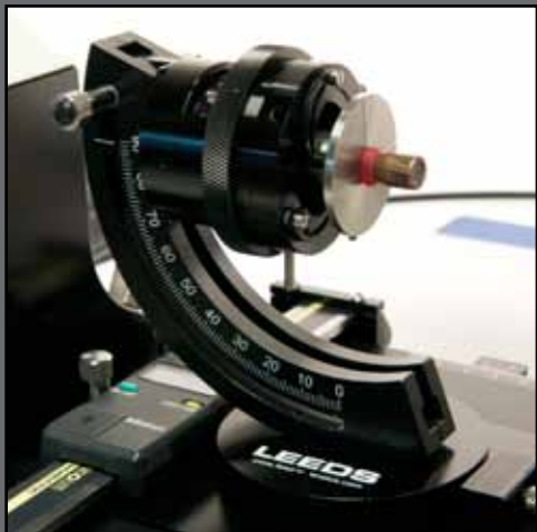
Bullet mounted to a mini-platter with sticky wax